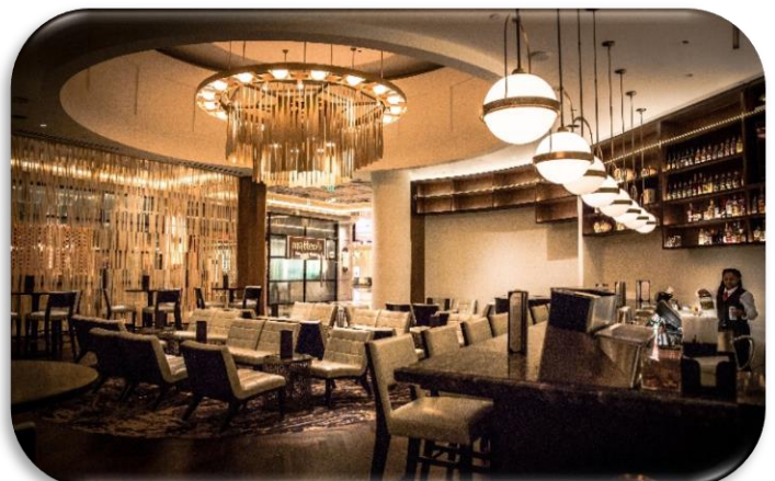
Main Bar & Lounge

Cuisine: Steakhouse Address: 3355 Las Vegas Blvd. S City, State: Las Vegas, NV 89109 Telephone: (702) 216-6499