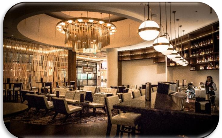
Main Bar & Lounge

Cuisine: Steakhouse Address: 3355 Las Vegas Blvd. S City, State: Las Vegas, NV 89109 Telephone: (702) 216-6499