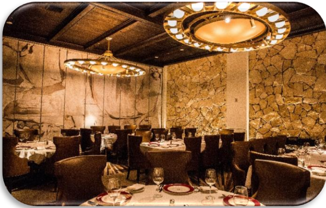
Cobblestone 1 & 2