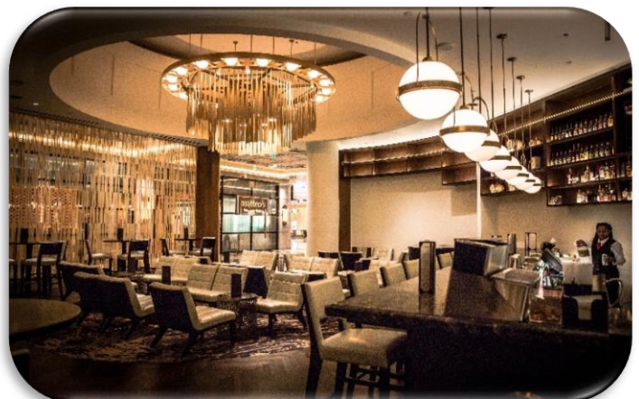
Main Bar & Lounge

Cuisine: Steakhouse Address: 3355 Las Vegas Blvd. S City, State: Las Vegas, NV 89109 Telephone: (702) 216-6499